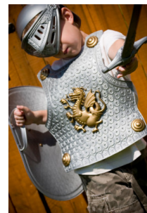
Heir to history of war

Boys were once trained by their fathers in the trade or profession of the elder male. Farming and craftsmanship were often the pride of an entire family, village, or community. But not any more, except in isolated examples and locations. Perhaps the repetitiveness of war after war, century after century broke the bonds of father and son relationship.