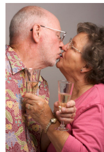
To happy endings!

Until we honor the best in ourselves and every other creature, we will be miserably lonely and pathetically wasted in the grand cosmic scheme unfolding around us. Our seemingly insurmountable differences are but the catalyst that will bring the genders together, hopefully, before an unhappy ending.