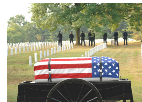
Another sacrificial child

The vice grip imposed by the robot military mentality may seem too frightening, too far-reaching, too intense to challenge, but who are you going to believe? Your rightful mind, or someone else's lies at the expense of your own flesh and blood? Is the sole purpose in life for women to