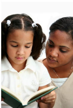
Worldwide teachers of children

In women's evolutionary effort to be included in the human family, we traded our voices for the sake of the survival of our children. Men could provide food and protection while we gestated, birthed, and reared his genetic stamp on the future.