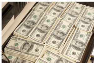
Money in jeopardy

How long will we continue to allow the forked-tongued male monsters to defile the human family with their games of hatred and revenge? How long will we worship the holy men who control our lives but can't control their own behavior?