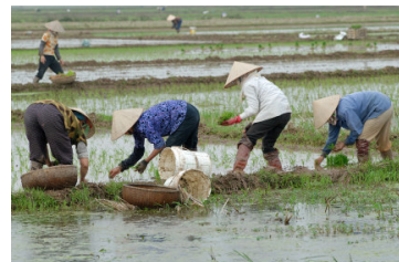
Women produce 2/3 of the world's food

It is important to realize that men and women are not in competition, for this is counter-productive to survival in the long run. Modern economic propaganda would have us believe otherwise, much to the yet unknown detriment of our children. If there is no one to grow the rice and no one to feed the children, there will be no children. It doesn't matter who does which, but to strangle the abilities of one's most important back-up partner is suicide for all.