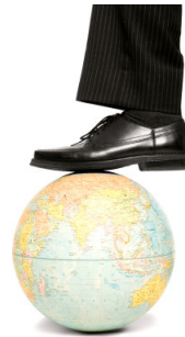
World in danger

Long ago, women traded independence for protection, and trusted our survival to a gender that lusts for reality as it appears to them . The 'man's world' reality floods through little black boxes into our homes, cars, offices, restaurants, waiting rooms, and institutions. Statistics regurgitate from every medium that humanity is in big trouble.